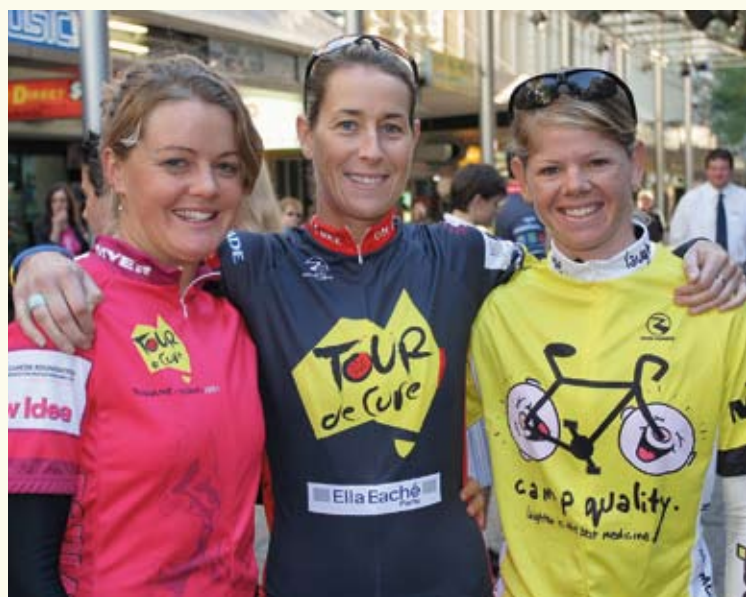
Money raised from the Tour de Cure was for research undertaken by the National Breast Cancer Foundation supported through the New Idea Breast Cancer Fund.