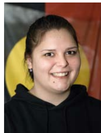
Two of the recipient students of bursaries from the Towards a Just Society Sub-fund.